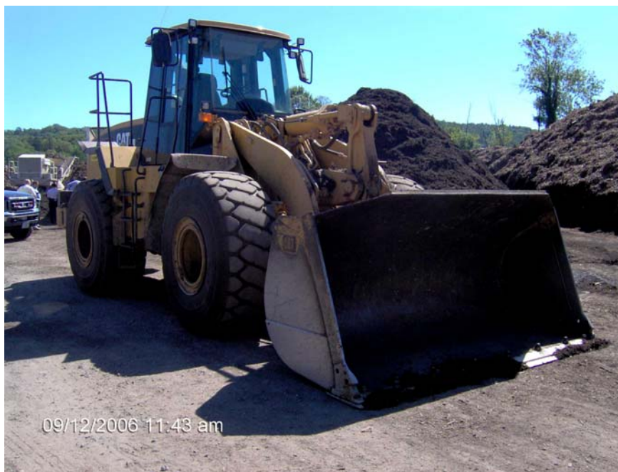
Photo 2. The front-end loader that was involved in the incident.

After the loader operator deposited the first bucket of approximately five cubic yards of mulch into the trailer, he noticed that the trailer door was open and the victim was not visible in the cab. The operator looked around but was unable to locate the victim. He became concerned and called for help. One town staff member called 911. In the meantime, town workers started digging into the compost pile in the trailer. The temperature of the mulch was approximately 135 degrees Fahrenheit. The police arrived at the site followed by paramedics within minutes after the 911 call was placed. The unconscious victim was uncovered 15 minutes later. The victim was transported to a hospital where he later died as a result of the injuries.