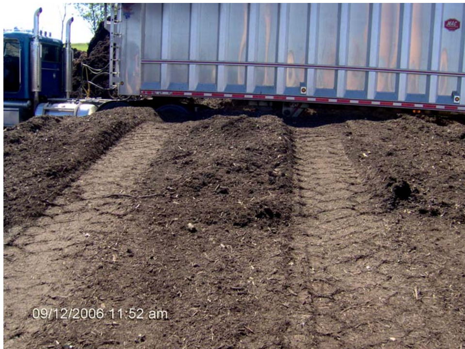
Photo 1. The victim's tractor trailer was parked next to a raised loading ramp during the incident.

On the morning of the incident, the victim was at the town solid waste site having his tractor trailer loaded with mulch. The victim parked the rig with the front part of the trailer next to a raised loading ramp (Photo 1) as directed by the town staff. A town equipment operator was to load the mulch with a front end loader (Photo 2). The town waste site loading procedure required a driver to stay in the cab when at the loading spot and to remain in the cab for the entire duration of the loading operation. According to the site's procedure, a driver would be expected to move the vehicle forward during loading in order to distribute the mulch evenly within the trailer. The loading operator assumed that the victim knew and understood the procedure since he had picked up mulch at the town site before.