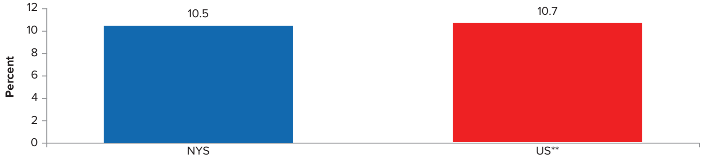
Figure 1. Diabetes* among US and New York State adults, BRFSS 2019

*Does not include reported gestational diabetes, prediabetes, or borderline diabetes.