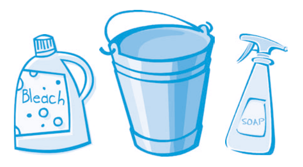
To make a bleach and water sanitizing solution, add one tablespoon of unscented household bleach to one gallon of water. Change the solution every few hours or when it looks dirty.

To sanitize surfaces after cleaning, wipe them with a sanitizing solution safe for food-contact surfaces, such as bleach and water.