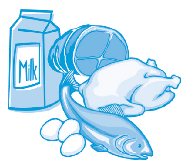
Some examples of potentially hazardous foods are meat, poultry, seafood, eggs, dairy products, cooked vegetables, cooked pasta, rice, and potatoes

Storing, cooling, and holding potentially hazardous foods properly will slow bacterial growth.