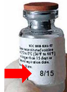
Vaccine Expiration Date: 08/15 Use through August 31, 2015. Do NOT use on or after September 1, 2015.