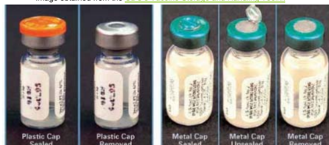
Image obtained from the CDC's Vaccine Storage and Handling Toolkit