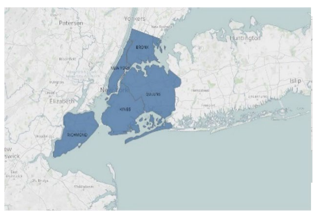
Service Area: Counties in which Providers of Amida Care Innovator Network, Inc. Offers Services