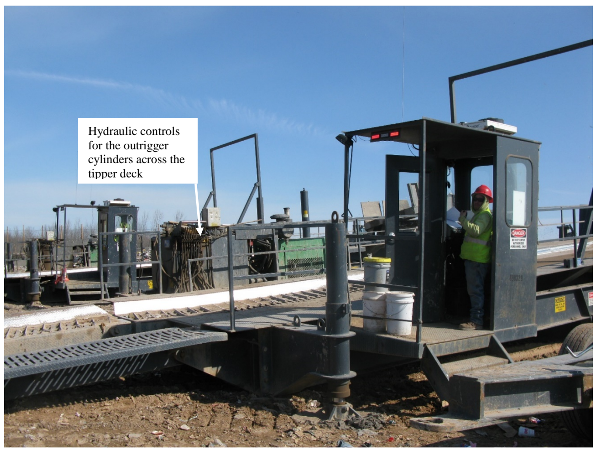
Photo 2. Hydraulic controls for the outrigger cylinders were on the left side of the deck and the operator's cab was on the right side.

when he was inside the cab. There was no radio communication for a tipper operator once he left the cab and was out on the tipper deck.