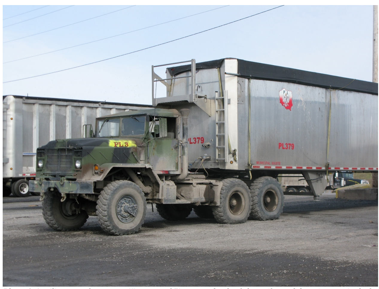
Photo 4. A military surplus tractor ("army truck") was used to haul the trailer and deposit waste in the landfill.

The "army trucks" did not have audible backup alarms, although the mirrors on the trucks worked. The tractor radios did not work most of the time due to the incompatible electrical voltages between the tractor and the radio. The "army truck" drivers reportedly often drove up to a working face and backed onto a tipper whenever they saw that the tipper was empty without getting the radio communication from a tipper operator.