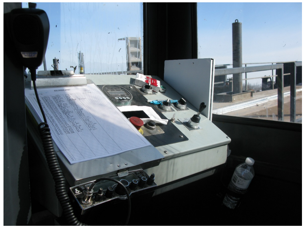
Photo 3. Tipper control panel and a CB radio inside the operator's cab.

Once on the tipper deck, the driver set the brakes, disengaged the trailer, and disconnected air and electrical lines while the tipper operator processed the paperwork. After completion of the paperwork, the driver drove the tractor off the ramp before the tipper operator raised, tilted, and emptied the trailer. After the trailer was emptied, the driver backed the tractor onto the ramp to hook up the trailer before driving off the ramp. According to the landfill management, tipper operators were required to remain inside the operator's cab when a tractor trailer was backing onto or driving off the tipper deck. However, this requirement was not in writing.