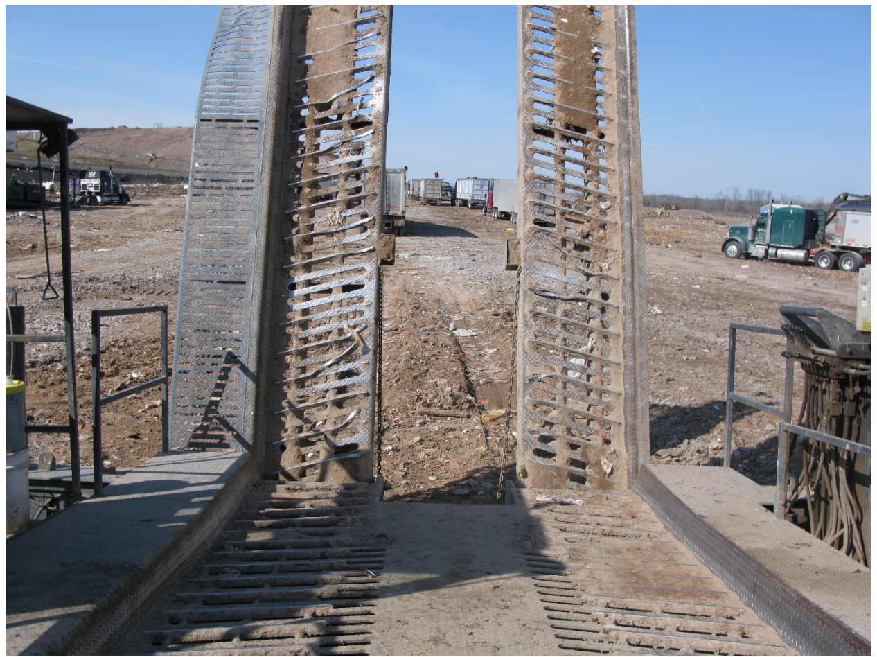
Photo 5. The access ramp is raised to stop the tractor trailer from backing onto the tipper deck when operator is outside the operator's cab.

After the incident, the landfill began requiring that the tipper operator raise and tilt the metal access ramp to stop tractor trailers from backing onto the tipper deck every time a tipper operator is outside the operator's cab and on the deck (photo 5).