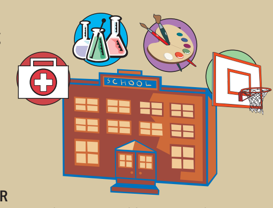
Instruments containing mercury can be found virtually anywhere on school property in the nurse's office, science rooms, gymnasiums, art rooms and boiler rooms.

spill, prompt notification of one's supervisors and cleanup staff, and training of appropriate personnel on cleanup procedures. Mercury spill cleanup kits are easy to use and can be purchased from many suppliers such as Fischer Scientific, Flinn Scientific, Lab & Safety Supply, Mallinckrodt/Baker or VWR Scientific. Or, you can make your own kit as described in this brochure.