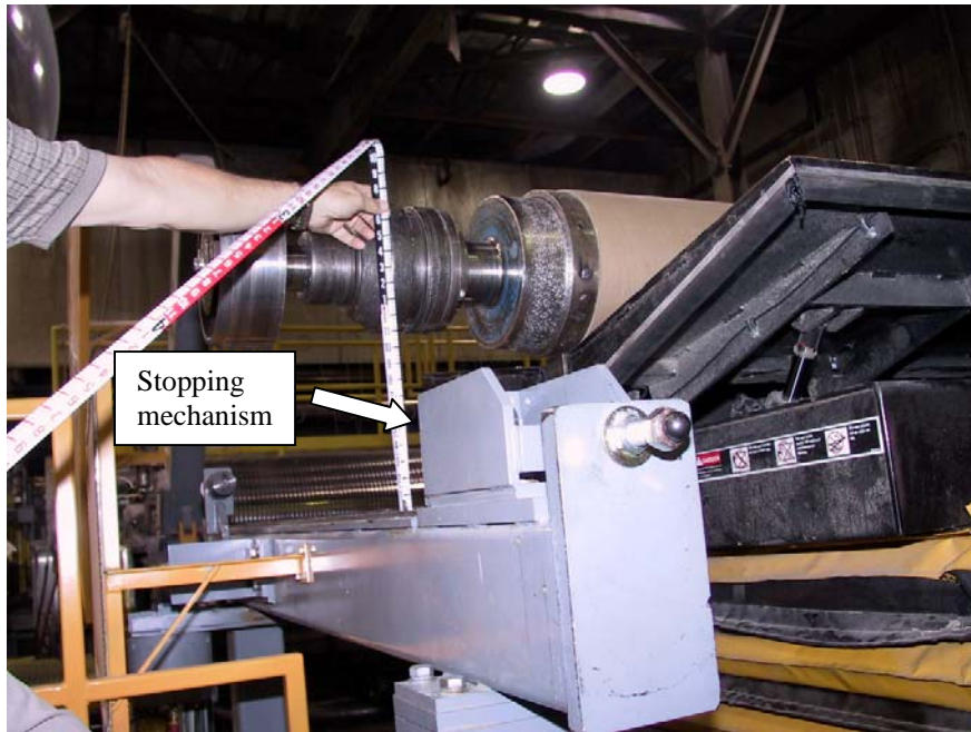
Figure 3. During the incident, the steel spool was above the stopping mechanism on the tracks and only held by the tilter.

Upon looking underneath the platform, the owner observed a damaged hydraulic hose. The damaged hose was the main feed hose to the two cylinders that pressurized the tilting plate. Realizing that the work was more expansive than he had originally thought, the owner decided to let the crew take a break. He unlocked the machine power switch after the rest of the crew left the unloading area. The welder left the plant during the break.