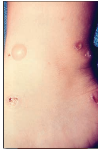
Infection site: ankle May be mistaken for spider bites

It is also possible for a pre-existing cut, turfburn or other irritated area on the skin to develop an infection with CA-MRSA if the area is not kept clean and dry.